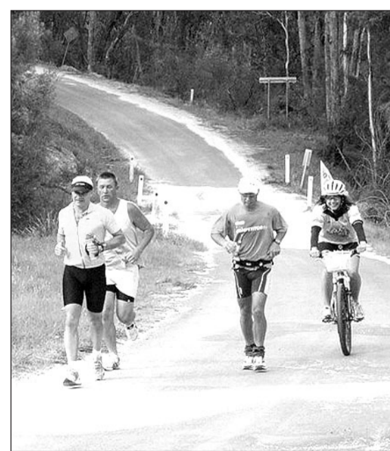
• Runners pass Stony Creek.